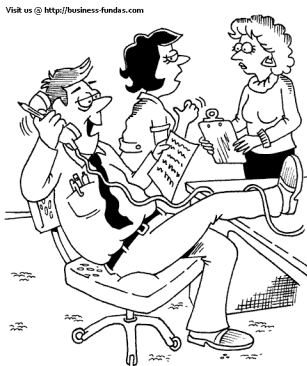
"We call him AT&T...that's short for 'Always Talking & Talking!'"