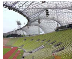
Building and Construction