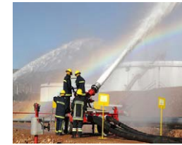
Aqueous Film- Forming Foam