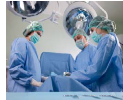
Healthcare and Hospitals