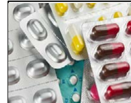
Chemicals and Pharmaceuticals