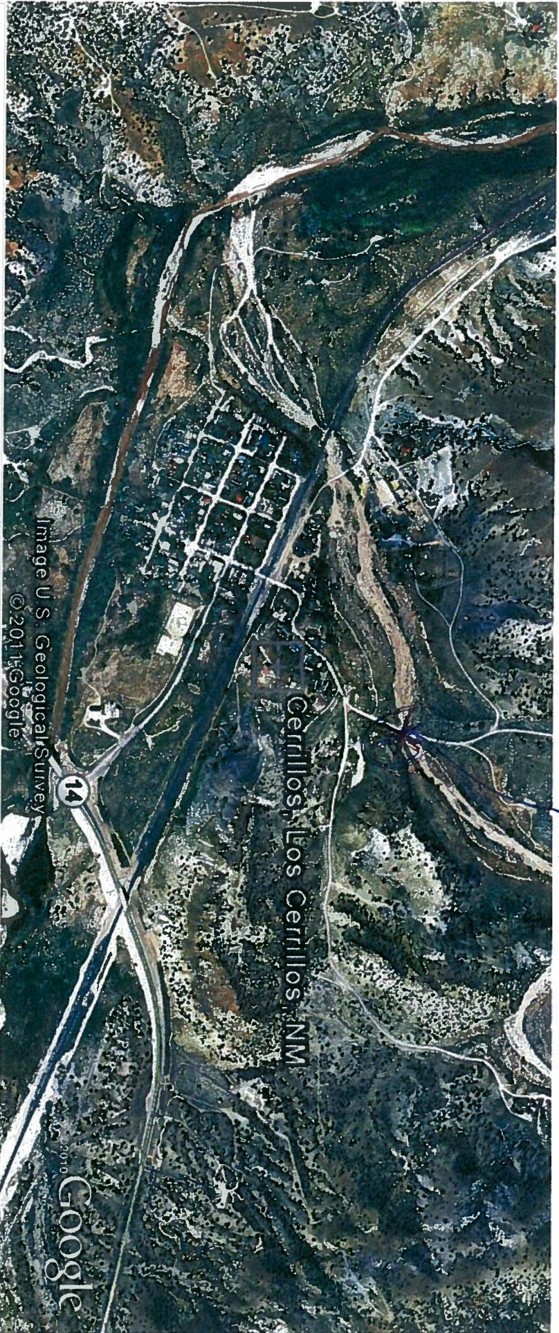
Cerrillos, Los Cerrillos, Santa Fe, New Mexico