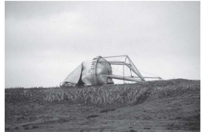
A water tower that has exceeded its useful life!

The worksheets and other information in this guide will also help you begin to develop an overall strategy for your system. Using this guide along with EPA's "Strategic Planning: A Handbook for Small Water Systems" (EPA 816-R-03-015) will help you develop, implement, and receive optimal benefit from an asset management plan that fits in with your system's overall strategy.